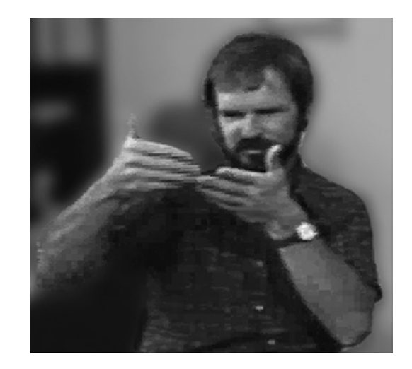
Figure 1 Illustration of the sign INTRODUCE produced by a signer with Usher syndrome. The sign INTRODUCE is produced near the waist by normally sighted signers.

If signers with tunnel vision systematically produce signs within a restricted and raised signing space, but blind signers do not, it will provide evidence for the importance of visual self-monitoring during sign production. However, another possible explanation for such a result is that the restricted signing space is actually a signal to the sighted addressee to produce signs in a smaller space so that the individual with Usher syndrome can see their signing. That is, the person with Usher syndrome is indicating (either consciously or unconsciously) "sign like me so I can see you." Because the face conveys grammatical information in ASL, signs need to be produced in a smaller space near the face in order to be perceived through the narrowed visual field of a person with tunnel vision. In contrast, completely blind signers comprehend ASL through tactile signing, and thus, such a communicative signal is not necessary. Tactile signing is a variety of ASL that is perceived by placing the hand lightly on the back of a signer's hand in order to perceive the signs through touch and movement