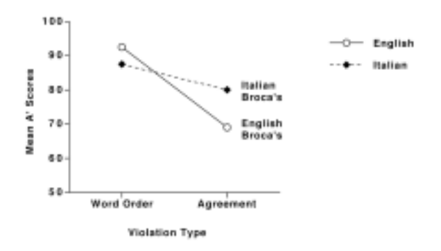
Figure 2: Grammaticality Judgment Scores for English vs. Italian-speaking Petients with "agrammatic" Broca's aphasia

lexical and grammatical errors, forcing a rethinking of aphasic syndromes in terms of processing deficits rather than loss of linguistic content. This conclusion is supported by studies of sentence comprehension, production and grammaticality judgment, all showing significant differences between patient groups that correspond directly to cross-linguistic differences in normals. Across studies of both comprehension and production, both Broca's and Wernicke's aphasics retain the basic word order biases of their native language (e.g. SVO in English, Italian, German; SOV in Turkish and Japanese; both SVO and SOV in Hungarian, depending on definiteness of the object). In the same studies, use of grammatical morphology proves to be especially vulnerable in receptive processing, but the degree of loss is directly correlated with strength of morphology in the premorbid language. In studies of grammaticality judgment, fluent and nonfluent patients show above-chance abilities (at equivalent levels) to detect subtle grammatical errors, often in constructions that they themselves can no longer produce without error (Devescovi et al. 1997 for Italian, Linebarger et al. 1983, Lu et al. in press for Chinese, Shankweiler et al. 1989 for Serbo-Croatian, Wulfeck 1988).